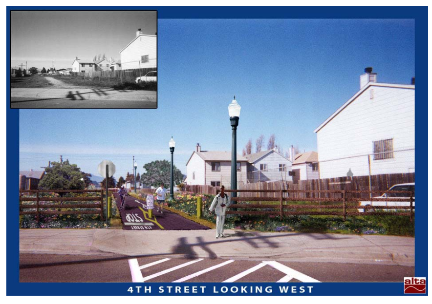
Artistic rendering of the future Richmond Greenway

The Richmond Greenway is a community bicycle and walking trail that will bring new recreational opportunities and open space to Richmond residents (see map on reverse). Join City of Richmond staff, Rails-to-Trails Conservancy, community members and various stakeholders to learn more about the Richmond Greenway project.